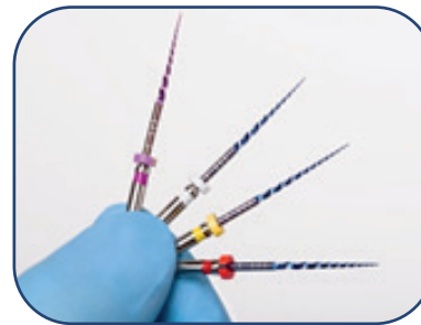
The four instruments of the BlueShaper® system, created in Spain for the world's odontologists.

(Text reproduced with the permission of the Author and the Spanish dental magazine 'Gaceta Dental'. Adapted from Gaceta Dental nº 332, pp. 74-79. Feb 2.021.